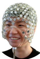
Geodesic Head Web