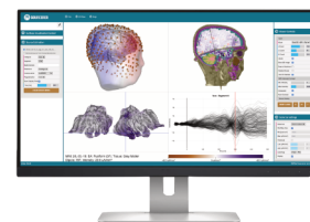
SOURCERER + FLOW

The BEL EEG System One is a complete system for EEG acquisition and analysis. Designed with new hardware architecture for accuracy, efficiency, miniaturization, mobility, and on-board storage and computation, the BEL Amp One amplifier offers innovations like no other. The BEL View software for acquisition and simple review is intuitive and easy to use, suitable for all applications and experience levels.